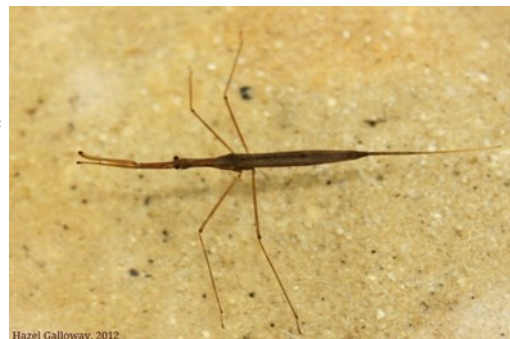
Hazel Galloway, 2012